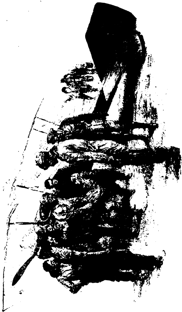
"She's not dead?" I asked in a breath